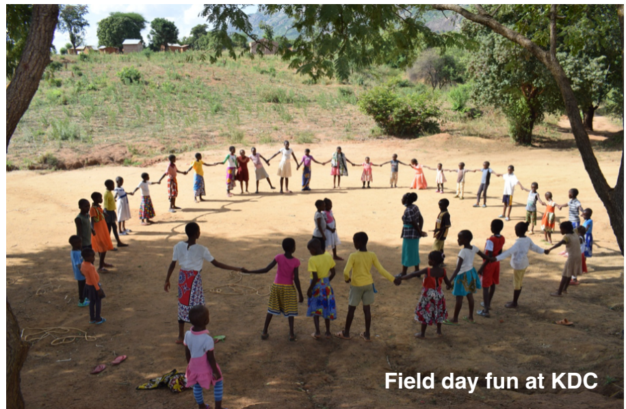
Field day fun at KDC